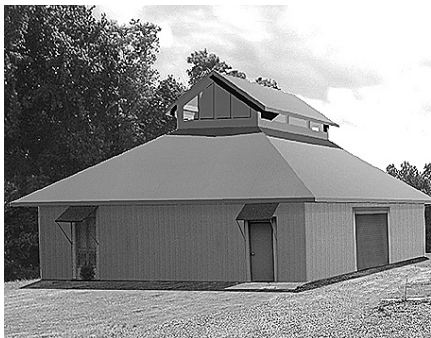
Image of the Menokin storage and assembly building