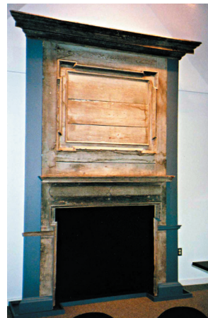
Menokin's front doorway is now on display with its best chimneypiece.