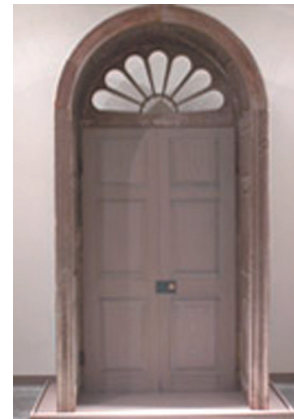
The reassembled front doorway of Menokin.