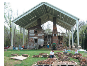
Quoins and stone window surrounds were excavated from the ruin this spring.